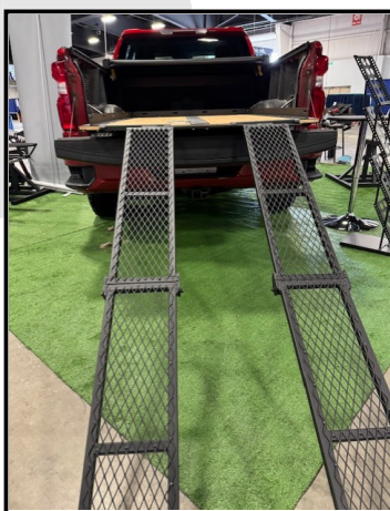
GRIZZLY Bed Slide extends the bed by up to 4' in length