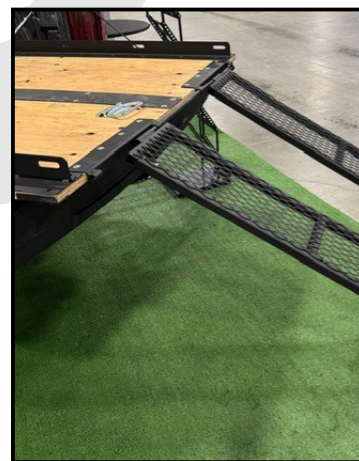
Grizzly Ramp sold separately