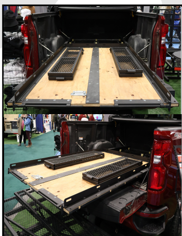
GRIZZLY Bed Slide fits in ANY bed and is adjustable to 42" to 48" wide beds!